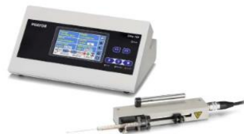
Cat No. 20-0100 (HAMILTON Syringe is not included)

This product features a professional and innovative design, capable of accommodating both Metal Needle Syringes (e.g., Hamilton syringes) and Capillary Glass Pipette. It is widely used in model animals such as mice, rats, zebrafish, insects, and toads, as well as in vitro cells (e.g., egg cells, embryonic cells). It is ideal for microinjections of viruses, dyes, proteins, drugs, and more.